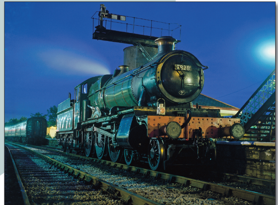
On the 3 July 1992 'Odney Manor' was the motive power on a Dining Train. At dusk on a summer evening the clear sky retains some colour to fill the background.