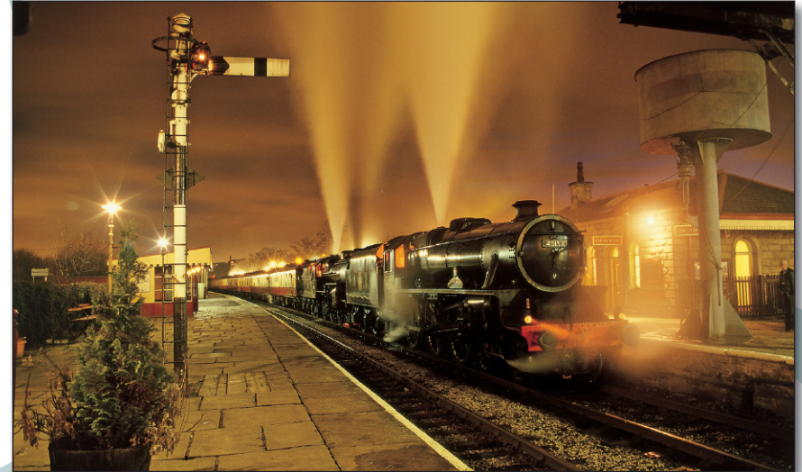
Once the Bury-bound train had departed it was over the footbridge to capture the double-header with both locomotives having plenty of steam to spare.