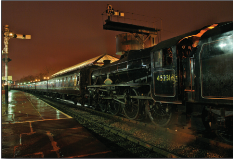
The final 'Santa' trains of 2008 were hauled by Black Five No. 45231 'The Sherwood Forrester'.