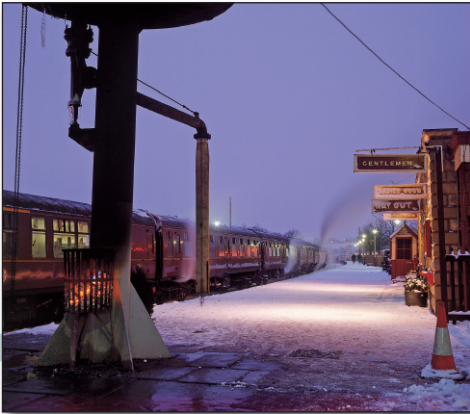
An extremely cold 27 January 1996 at Ramsbottom Station.