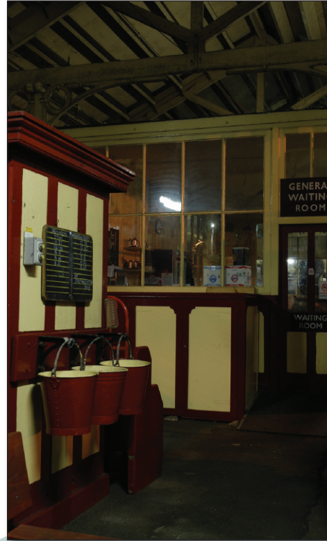
With the exception of the plastic dustbin and liner these photographs could have been taken over fifty years ago.